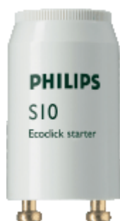
STARTER S10 EUR